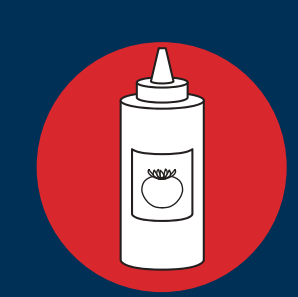
Take inventory of condiments and favorite seasonings