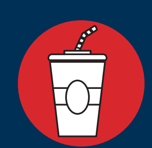
Fill your fridge with favorite beverages