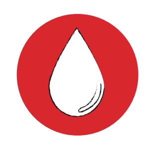
Test all outdoor gas, power and water lines